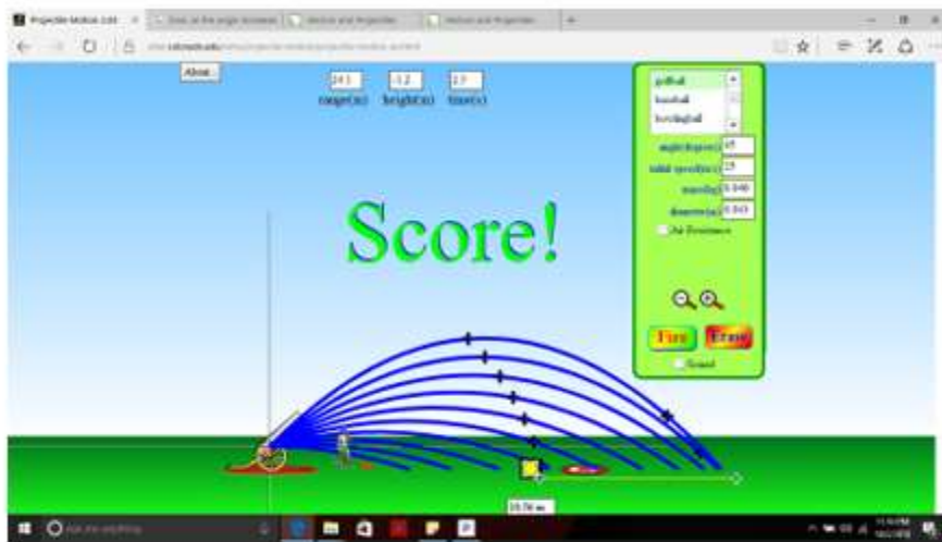
Figure 1: A screen of parabolic motion at PhET simulation

PhET, which is a simulation developed by the University of Colorado, is one of the most common easy to use software in science education. PhET simulations designed to demonstrate the basics teaching physics, biology and chemistry for the benefit of classroom learning or individual learning (Perkins et al., 2006; Daskan & Yildiz, 2020).