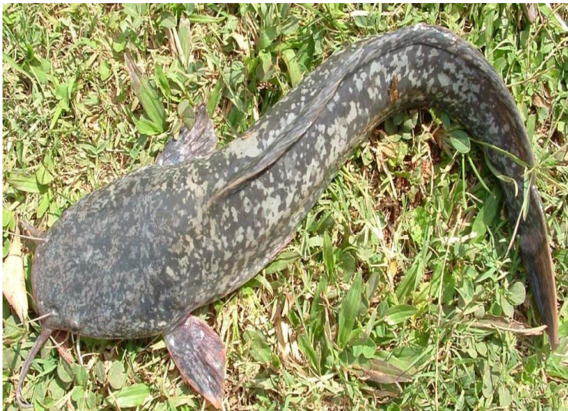
FIG 2: Pictorial Presentation of Clarias gariepinus

Mbiama, Odhiogbor and Odereke along Orashi River using the services of artisanal fishermen fishing with the aid of basket trap fishing gear. Pictorial representation of C. gariepinus is presented in Figure 2.