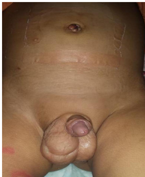
Fig (1): Marked Rt secondary hydrocele after Rt laparoscopic inguinal hernial repair by purse-string at 12 th week postoperative.