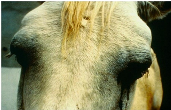
Figure 5: Horse exhibiting oedema of supraorbital fossae