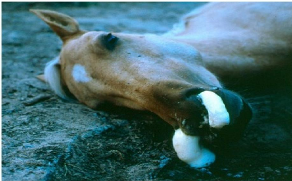
Figure 4: Horse suffering from severe respiratory distress

acute fever (39-41), followed by the sudden onset of severe respiratory distress. Infected animals often stand with forelegs spread, head extended, and nostril is fully dilated. There may be periods of recumbence and terminally quantities of frothy fluid may be discharged from the nostrils. Other clinical signs may include tachypnea, forced expiration, profuse sweating, spasmodic coughing, and frothy serofibrinous nasal exudates. Dyspnea usually progresses rapidly and the animal often dies within a few hours after the respiratory signs appear (Radostits et al. , 2007).