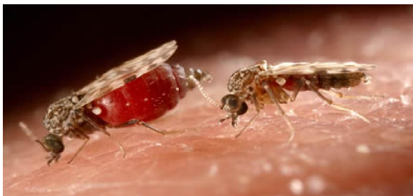
Figure 3: Adult biting midge, showing blood filled abdomen; Source: (Erasmus, 1998).