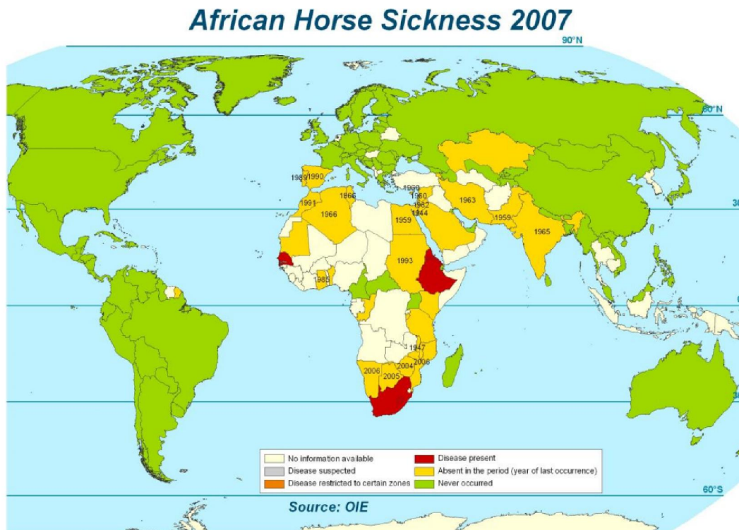
Figure 2: African horse sickness geographical distribution Source: (OIE, 2007).

occasionally to Northern Africa. A few outbreaks have occurred outside Africa, in the near and Middle East and Iberian Peninsula. In the Republic of South Africa outbreaks of AHS were recorded in almost the whole country. The decline in the number of AHS outbreaks over the last decades of the 20th Century, particularly in the southern areas of South Africa, is partly due to the elimination of large free-ranging populations of zebra ( Equus burchellii ), which are considered to be the natural cycling host for the virus (Venter et al. , 2006).