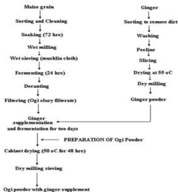
Fig. 1: Flowchart for the production of Ginger Ogi powder