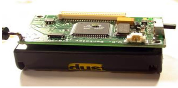
Figure 2. The Mica Mote Node

Mica Mote is a commercially available product that has been used widely by researchers and developers. It has all of the typical features of a mote and therefore can help you understand what this technology makes possible today. MICA Motes are available to the general public through a company called Crossbow. This low power consumption allows a MICA Mote to run for more than a year with two AA batteries [9, 10]. A typical AA battery can produce about one thousand milliamp-hours.