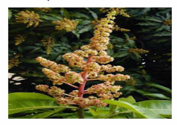
Malformed floral inflorescence