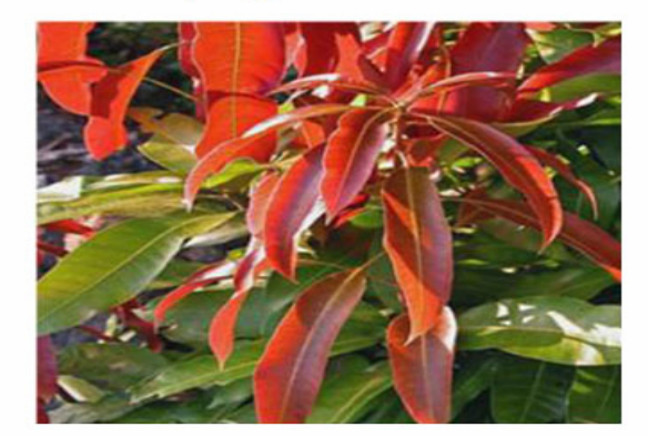
Malformed vegetative tissue