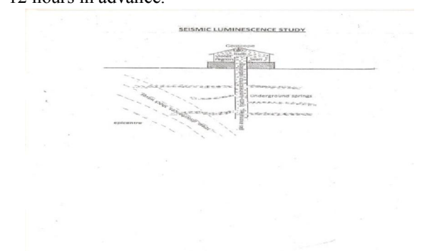
Electro Geopulses Study:

Due to all reasons the room may appear violet in colour then we can predict the impending earth quakes 12 hours in advance.