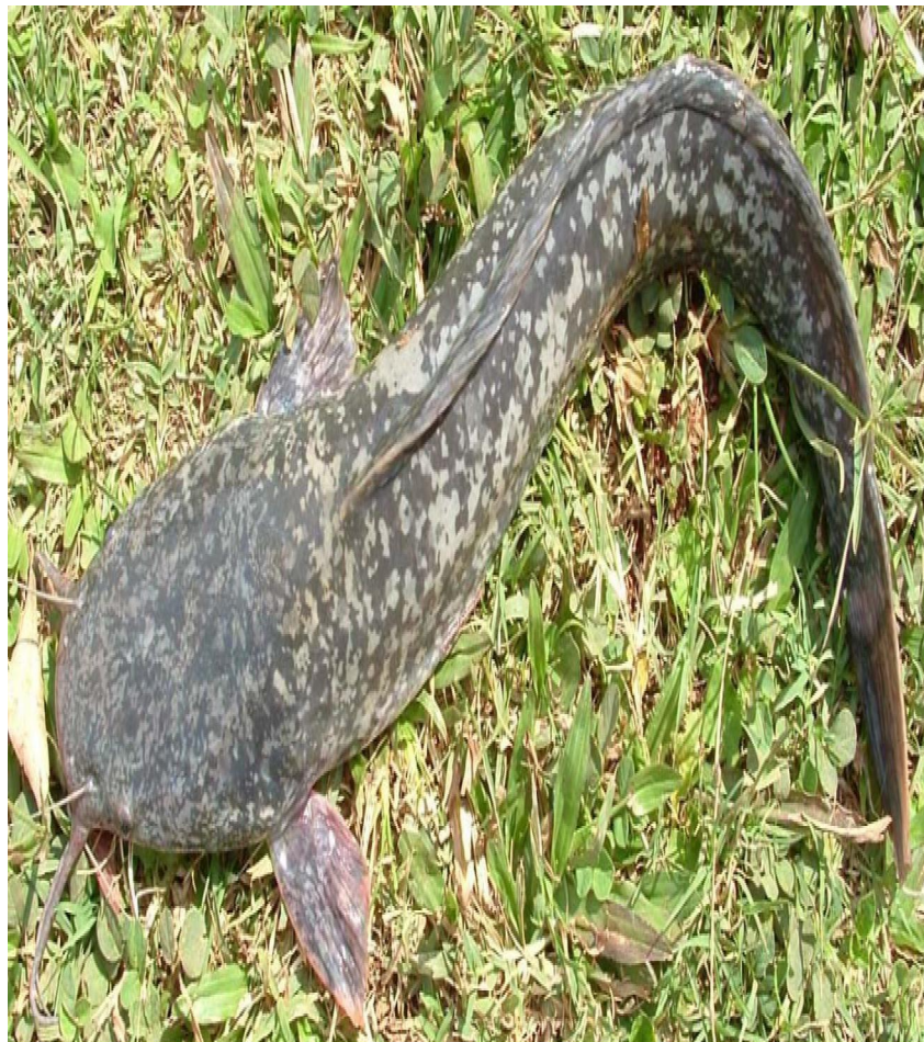
FIG 2: Pictorial Presentation of Clarias gariepinus

Ten (10) Samples of Clarias gariepinus were collected on a monthly basis for 12 months (between May 2016 and April 2017) at Oshiobele, Akinima, Mbiama, Odhiogbor and Odereke along Orashi River using the services of artisanal fishermen fishing with the aid of basket trap fishing gear. Pictorial representation of C. gariepinus is presented in figure 2.