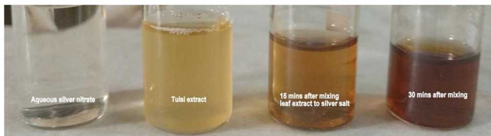
Fig. 2 Change in the colour of the solution with time when plant extracts are added to silver salt (Jain & Mehata, 2017).

required plant then boiled with water or ethanol to get aqueous plant extract. This plant extract in a fixed ratio is then incubated with desired amount of \text{AgNO}_3 solution. With the passage of time, the color changed from colorless to brownish due to surface enhanced properties of silver nanoparticles.