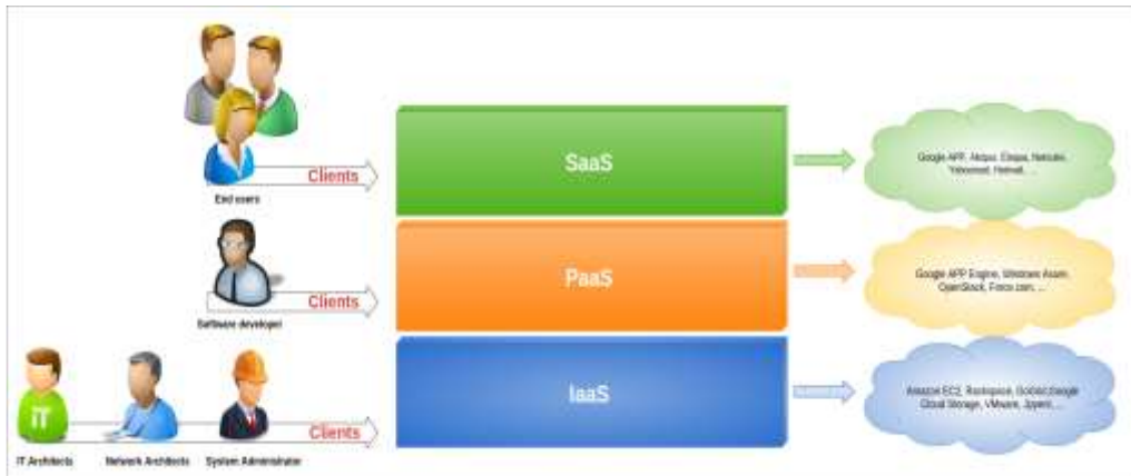
Figure 1: Cloud computing architecture

International Data Corporation (IDC) conducted a survey (Gens 2009) (refers to Figure.3) and asked from 263 IT organizations to rank the critical obstacles that prevent cloud computing from being adopted.