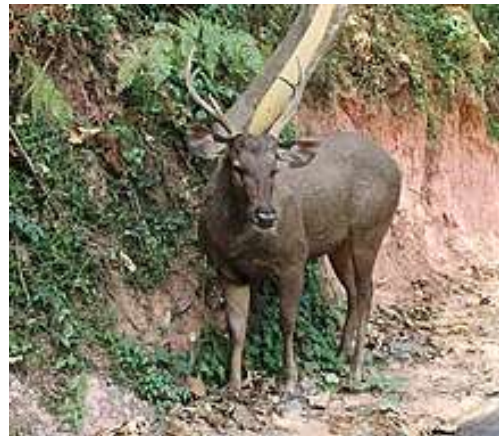
Sambar deer in the at Nidani Reserve Forest, Alwar

males to court. When mounting, males do not clasp females. The front legs of the male hang loosely, and intromission takes the form of a "copulatory jump".