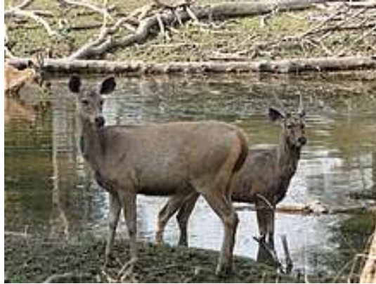
A sambar hind with a young stag at Nidani Reserve Forest, Alwar

Courtship is based more on tending bonds rather than males vocally advertising themselves. Females move widely among breeding territories seeking