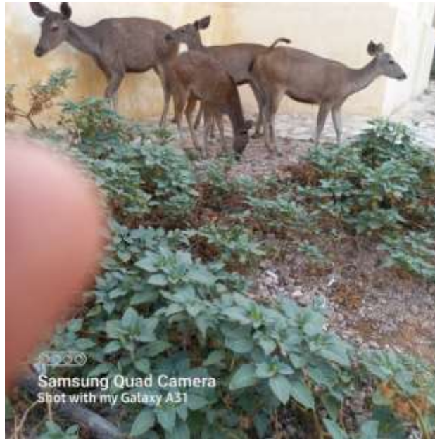
Herds of Sambar at Nidani Reserve Forest, Alwar