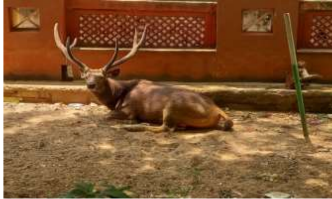
Rest by Sambar at Nidani Reserve Forest, Alwar

In sambar the typical group is small, numbering fewer than six individuals (Schaller 1967). The characteristic social unit is one hind and one fawn or one hind, one yearling and one fawn (Schaller 1967, Kelton 1981, Downes 1983). Family groups usually travel in a single file led by the adult female (Kelton 1981). During the rut, dominant stags are frequently seen with hinds and occasionally with other stags who -may challenge the dominant stag for breeding opportunities (Lewis et al. 1990). Average group size of sambar is reported to be 4 to 5 individuals (Jerdon 1874 and Prater 1971). Khan et al. (1995)