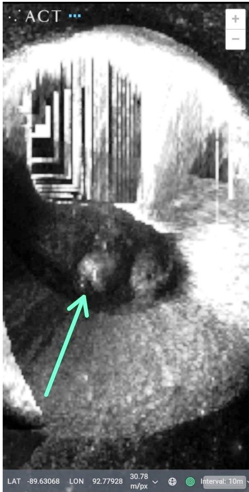
Fig. 1. A transformer - like structure (top) above a cave and a generator like object (arrow, bottom) inside a cave on the South Pole of the Moon.