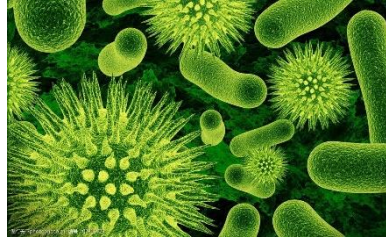
This is a germ

The third picture is the coronavirus, which may be the Wuhan Virus Research Institute. I'll download it to study it. Look at the first fruit and the fourth picture are the internal structure of the new pneumonia virus. It's the same as the internal eccentric system structure of the above elliptic diagram. Because the ellipse was discovered 40 years ago when I invented the eccentric vortex engine, I drew a sketch and wrote it in the comprehensive discussion on unified field theory published in the Journal of science and technology consulting guide and the article "my understanding and application of Tai Chi diagram", which is the current article, the ellipse. Forty years later, foreign experts found that there is also a centripetal cyclone in the center of the black hole, and there is also a slightly larger cyclone thrown out by centrifugal force. Therefore, the diffuse air flow of the black hole and the centripetal vortex accelerate around and convert into suction, so there is universal gravitation. Newton only did not move to produce gravity, while physics master Ritchie was a little moving to have gravity.