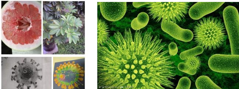
This is a germ

The following is a photo of the real fruit.