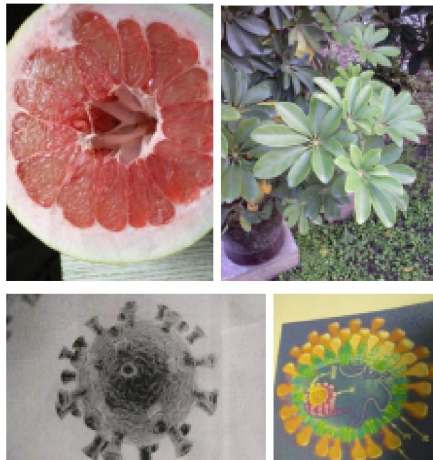
Cancer cell bacteria

The air inside HIV is rushed out of the small stomata on the cell shell by centrifugal force. Because the air is blocked by the body such as the skin, the air flow is outside the HIV shell and swirls into HIV crowns. For example, the first picture is the fruit of a plant. It is also based on the six force fields on the ellipse diagram. There are also three masses of large, medium and small. The energy that is copied is how many small molecules are copied, which are arranged in sequence. When the hot air flow from the outside of each crown moves towards the center of the cell, the vortex at low temperature accelerates the vortex into the eccentric cavity field of the cell, and it is formed by the vortex system like multiple spiral arms of the starfish, which will make the eccentric cavity field last time. When the sub-cyclone clusters