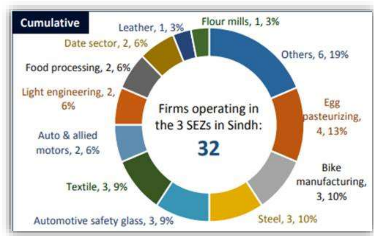
Figure 3

In Sindh area there are three main economic zones which is operating in Pakistan under CPEC projects. In this Figure 3 shows the cumulative data of three economic zones, which is specifically related to firms operation in SEZs. However it is said that the industrial sector contribution in Pakistan GDP is positive and this strategy is improving economy and attract foreign investors. It is proven that Karachi is one of the growth pole in Pakistan who generate revenue and economic growth.