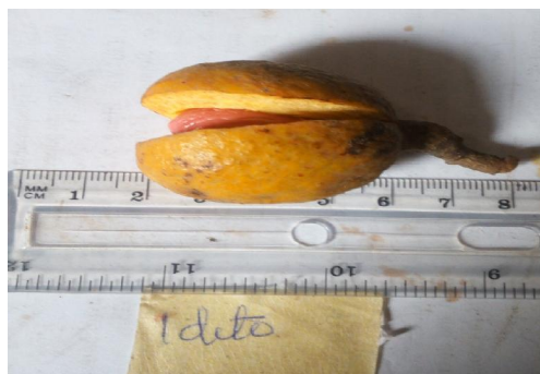
Plate 2: Fruit dehiscence of P. angolensis

Fruit Dehiscence varied within and among the locations (Table 3 and Plate 2), in GB Fruit Dehiscence lasted for 30 days started in April 1st to April 30 th , 2018. In AJ, it lasted for two months, started in March, 2018 to April 30 th , 2018. Fruit Dehiscence in OT lasted for three months (121 days) started in December 15 th , 2017 to 31 st March, 2018. In AY, it lasted for two months, started in March, 2018 to April 30 th , 2018; ID lasted for six months (181 days), started in January 25 th , 2018 to June 30 th 2018. Fruit Dehiscence lasted for three months (91 days) in AD started in April, 2018 to 1st June, 2018.