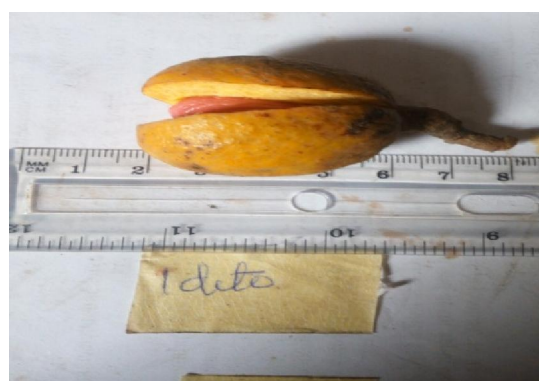
Plate 2: Fruit dehiscence of P. angolensis

Fruit Dehiscence varied within and among the locations (Table 3 and Plate 2), in GB Fruit Dehiscence lasted for 30 days started in April 1 st to April 30 th , 2018. In AJ, it lasted for two months, started in March, 2018 to April 30 th , 2018. Fruit Dehiscence in OT lasted for three months (121 days) started in December 15 th , 2017 to 31 st March, 2018. In AY, it lasted for two months, started in March, 2018 to April 30 th , 2018; ID lasted for six months (181 days), started in January 25 th , 2018 to June 30 th 2018. Fruit Dehiscence lasted for three months (91 days) in AD started in April, 2018 to 1 st June, 2018.