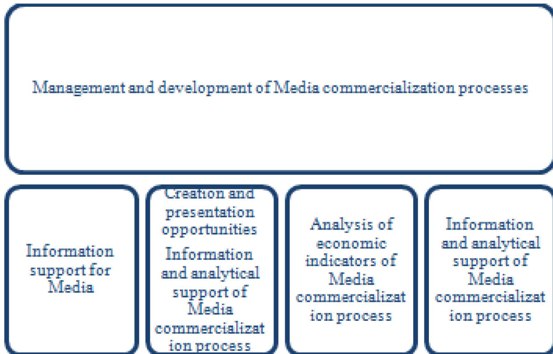
Figure 2. Information support mechanism of Media commercialization process

The principle of the application of Bunda financing schemes is based on the SL, that is, on the principle of the final implementation of the activities of the mass media, it is carried out in 2 stages (Figure 2).