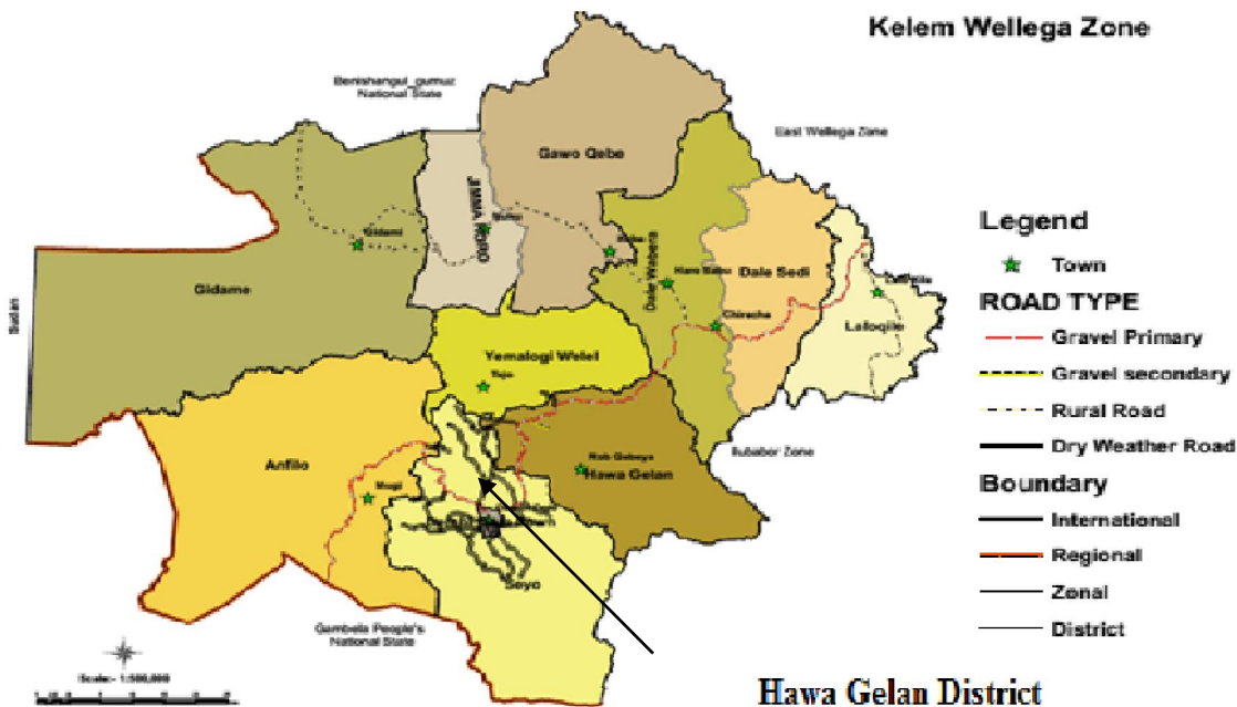
Figure 1: Map of study area

colonies of bees and produced 330, 000kg of honey [7].