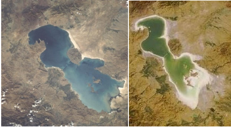
Figure 1: Satellite images of Lake Urmia in the probe and the water has receded ( http://eol.jsc.nasa.gov )

In most countries of the South West Asia region, desertification and loss of agricultural land and fertile land is a dominant factor resulting from inappropriate human intervention in these areas. Dust that people living in these areas in recent years living on or near narrowed, And cause all kinds of diseases is open from results desertification in those countries. Hence, part of the budget is spent on desertification. Air pollution in large cities and densely populated area of Tehran and Istanbul from other problems such as environmental issues in the region is South West Asia.