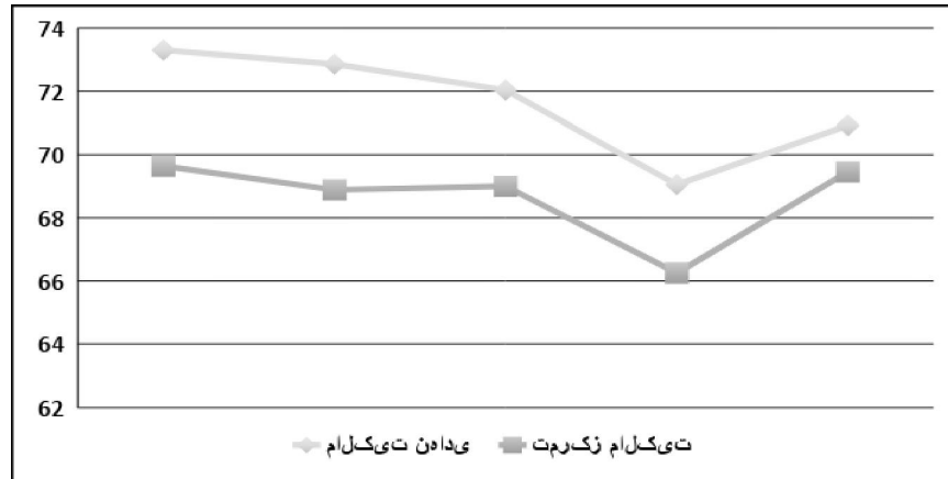
Figure 4-3: Average annual trend of institutional ownership and ownership concentration of sample companies.

According to this example, the value of institutional ownership and ownership concentration of companies declined since 2013, but increased again in 2014. Regarding the control variables, the mean size of the sample companies (the natural logarithm of total firm’s assets) was equal to 13.886, the average