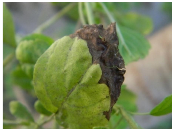
Fig 2. Leaf blight symptom on Ocimum sanctum

Parganas, West Bengal in 2013 and 2014 during the summer and rainy season.