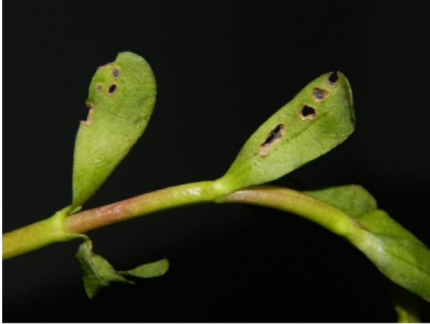
Fig 5. Shot hole symptom of Bacopa monnieri