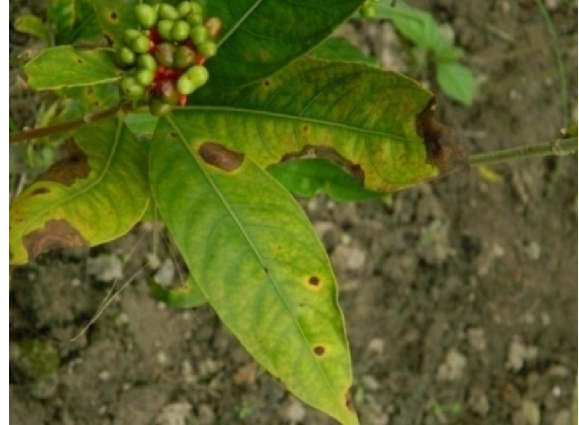
Fig 8. Leaf blight symptom on Rauwolfia serpentina