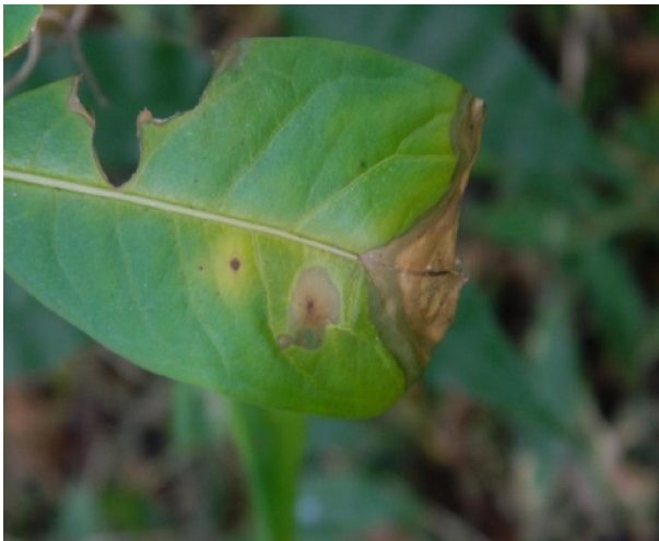
Fig 7. Leaf blotch symptom on Rauwolfia serpentina