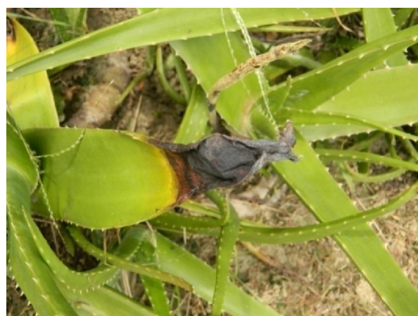
Fig 4 Leaf rot symptom on Aloe vera