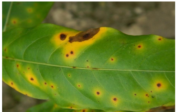
Fig 9. Anthracnose symptom on Rauwolfia leaf