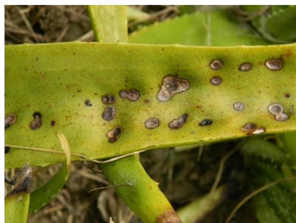
Fig 3. Leaf spot symptom of Aloe vera