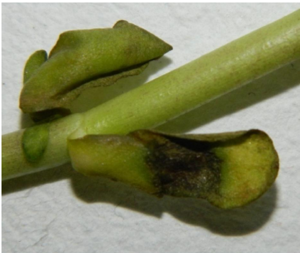
Fig 6. Leaf blight symptom on Bacopa monnieri