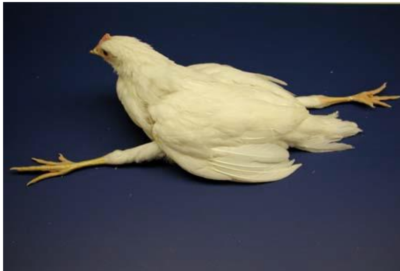
Figure 2. Paralyzed chicken with huddling stance (Splay-leg posture of chicken with sciatic neuropathy).

Birds between 12 and 24 weeks of age are most commonly affected. Clinically, Marek's disease presents as partial or complete paralysis of legs and wings (Quinn et al. , 2011). A particularly characteristic posture is that in which the bird has one leg stretched forward and the other backward as a result of partial or complete paralysis of the leg (figure 2). Sometimes, when the cervical nerves are involved, there may be torticollis (twisting of the neck to one side); and if the vagus and intercostals nerves are affected, respiratory symptoms may develop. The interval between onset of symptoms and death varies from a few days to several weeks (Vegad, 2008).