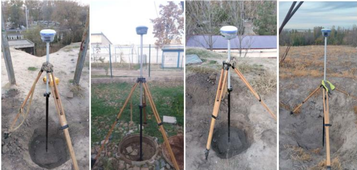
Figure 2. Installation of receivers at points of the frame network

The antenna height measurement error affects the accuracy of determining the point coordinates. The antenna height was measured 2 times before and after the observation with a tape measure or a special tool. If the difference between the antenna height values measured at the beginning and end of the session does not exceed 2 mm, their average value is taken. If the difference is more than 2 mm, then it is not allowed to work with this session. The process of measuring the height of the antennas was carefully carried out with the participation of a specialist and recorded in the journal. A fragment of the installation of devices and observations at the points of the frame network is shown in Figure 2 below [5, 8].