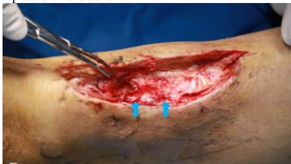
Figure 2 Intra-operative views show debridement with calcium sulfate loaded with antibiotics

After fenestration has been completed intramedullary debridement to remove any granulation tissues and sequestra by rongeur. samples were collected for laboratory examination. For adequate debridement intramedullary reaming, irrigation, and aspiration were done.