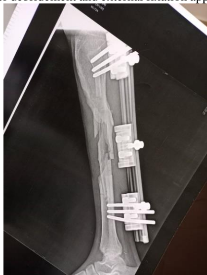
Figure 5: same patient after 6 months show union progression without signs of remission