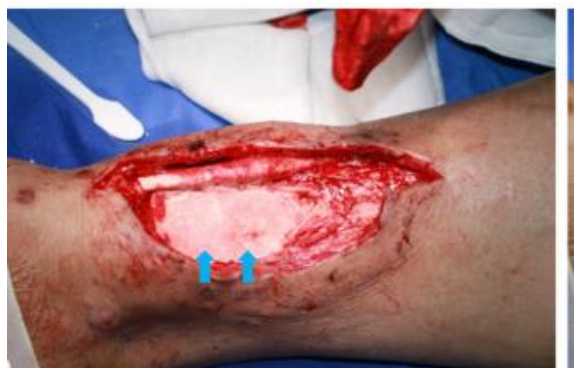
Figure (3): Intra-operative views of antibiotic-loaded calcium sulfate implanted into the bony cavity. The wounds were sutured directly. Flaps were used in the wounds with sever soft tissue defects.