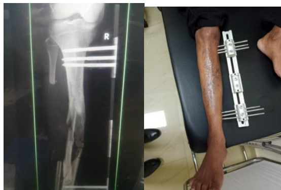
Figure (4): 33 years old male early postoperative x-ray after debridement and external fixation application