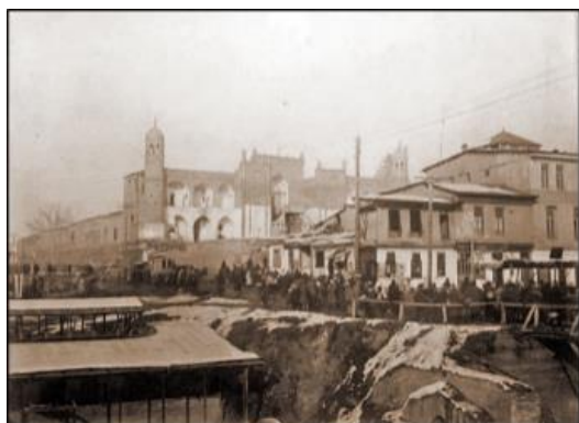
Figure 1. Tashkent city, Chorsu square. Photo 1890 year.

The photo shows photographs of the area in 1890 and 2020 (Fig. 1, Fig. 2).