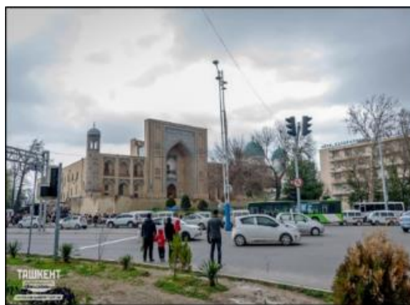
Figure 2. Tashkent city, Chorsu square. Photo 2020 year.

where: v is the fluid flow speed at a point on a streamline, g is the acceleration due to gravity, z is the elevation of the point above a reference plane.