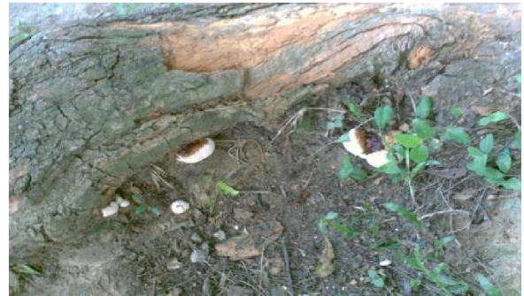
Fig.4: G. lucidum causing roots cracking and rotting of living Azadirachta indica tree

among the trees. The trees with exposed lateral roots were more susceptible to attack. However, the occurrences of G.lucidum were more severe in all trees in months of April, May, June and July than other months of the year. The trees have blemishes, shown no good adaptability to the area climatic conditions with non-satisfactory foliage production. The impacts of G. lucidum on the trees have caused cracking and rotting of the roots, cracking of the stem/trunk bark, sparse foliage and deformation of crown, and die-back of individual branches as shown in Fig. 4, 5 and 6 making them susceptible to wind damage. The impacts of G. lucidum also rendered the trees vulnerable to termite attack as shown in fig. 7 as well as many epiphytic plants such as Angel fire and Aerangis biloba . Generally, occurrence of G. lucidum has both significant ecological and economical impacts in the loss of Ornamental trees and maintenance expenses for replacement respectively.