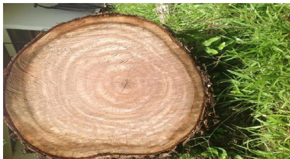
Fig. 8: A disk obtained from wind prone felled dying tree

Because G. lucidum attacked older Azadirachta indica trees, the killing impact seemed to be rather moderate or slow. However, the projection death of the remaining 59.22% or 212 trees could be fast as a result of poor condition of the trees. There is urgent need to interplant non-vulnerable trees like Gmelina arborea and harvest the avenue trees for production of furniture and other indoor wood products for the University community. A disk (Fig. 8) obtained from one of the dying tree was still hard enough without any visible xylem decay, stain, tunnel and discolouration to produce indoor wood products. The replacement of few missing stand with Delonix regia is not appropriate because D. regia is more susceptible to G. lucidum in UNIPORT and it could be attacked at tender age. More so, D. regia has undesirable buttress and lateral root pattern that could easily destroy the walk ways and even the main road.