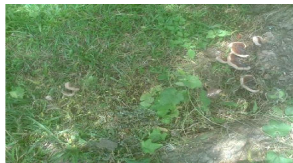
Fig.1: G. lucidum roots of living Azadirachta indica tree

The study showed that 146 or 40.78% of the initial total number of 358 trees were killed by occurrence of G. lucidum . Two types of Ganoderma were recognized: G. lucidum attacked live and dead woods; and G. applanatum attacked only dead stump/wood. The fungus is a soil and air-borne pathogen whose pronounced occurrence and wide spread were observed in rainy months of April to July. Occurrences were severe in March, August, September, October and November with less severity in December, January and February. The trends were similar for the 3 years of study as shown in table 1. In all the years, there were progressive increases in the damaging impact of G. lucidum in all trees and the total mortality associated with its occurrence was greater than 40% as at end of 2013. Other ornamental trees attacked by G. lucidum in the University premises include Casuarina equisetifolia , Delonix regia , Terminalia catappa , Terminalia superba and Mangifera indica .