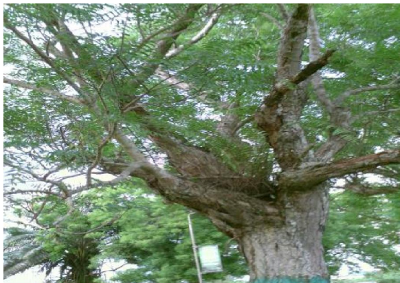
Fig.6: Die-back of individual branches on live Azadirachta indica tree