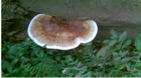
Fig.2: G. lucidum on trunk of dead Azadirachta indica tree