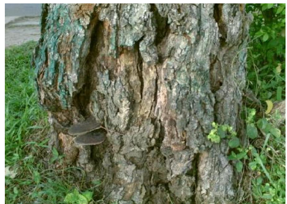
Fig.5: Cracking of trunk bark of a dying Azadirachta indica tree with dead fruiting bodies of G. lucidum