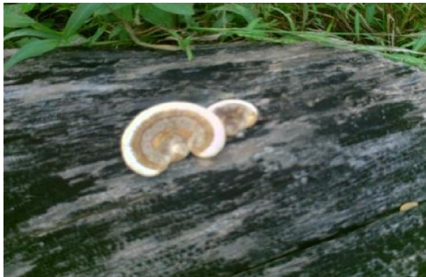
Fig.3: G. applanatum on dead trunk of Azadirachta indica tree