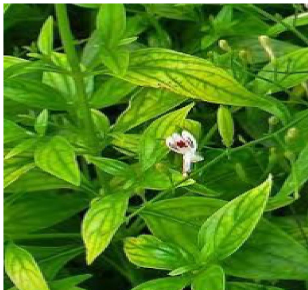
Figure 4: Andrographis paniculata

Paniculata plant extract has anti-venom activity against Naja naja venom. The leaves of A. paniculata contains andrographolide, the active constituent of which is diterpene and is responsible for ASV property by modifying the actions of proteins, and enzymes also inhibit snake venom phospholipase A 2 activities (Jhon et al. , 2011).