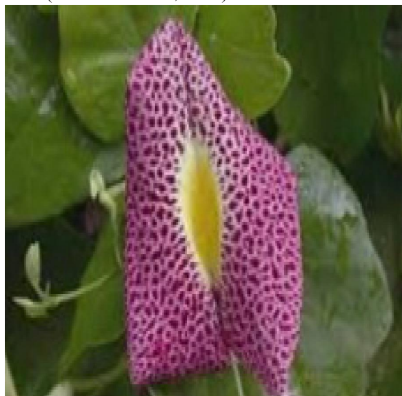
Fig. 3: Aristolochia odoratissima

In the low lands south of Maracaibo Lake people drink an infusion of Aristolochia odoratissima leaves to treat snake bites. Toxicity studies showed that the aqueous extract of A. odoratissima did protect the mice against the lethal effects of Bothrops atrox venom. Nevertheless, protection was only observed at higher doses of venom (8 and 16 mg/kg), without modifying the values at the lower doses (Sailakshmi et al. , 2012).