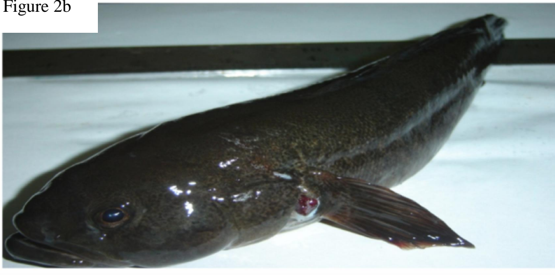
Figure 2a and b: Ventral and Dorsal view of Bathygobius saporator from Lagos lagoon, Nigeria.

3.2 Age and growth: A total of 500 specimens of B. saporator were caught from the Lagos lagoon, with a set of barrier traps between March 2010 and August 2010. They were preserved in 10% formalin for laboratory analysis. Data on the sex, total length and body weight measurements of the specimens were recorded in the laboratory. The growth studies were based on the analysis of length frequency data of Petersen method and that of von Bertalanffy (Bagenal, 1968; Pauly, 1979; 1980).