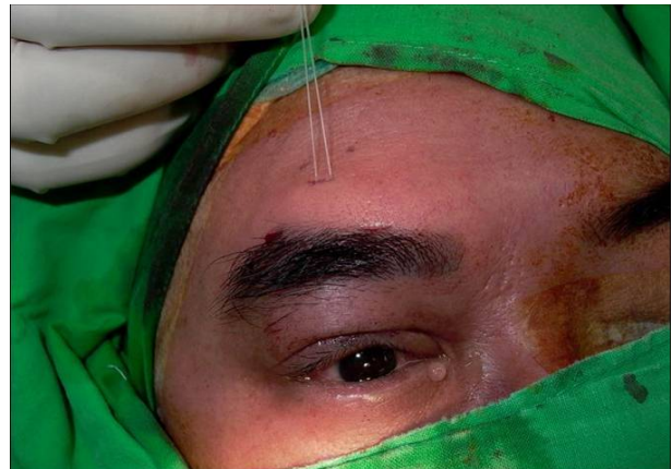
Fig. 3. Silicone frontalis sling repair of ptosis: final adjustment of lid position at frontal incision