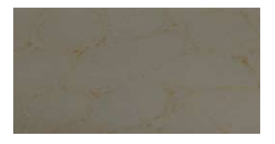
Figure 3. The testis of male normal rat (negative control) ( \times 400). This is PBS instead of first antibody (There were no AR positive cell in the testis of rat).