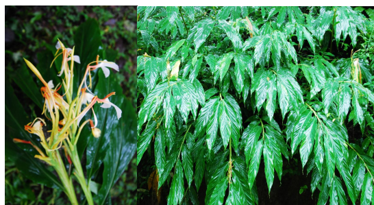
Hedychium spicatum growing in natural habitat

Market value : Rhizome dry weight @ Rs. 15-60 per kg