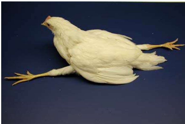
Figure 2. Paralyzed chicken with huddling stance (Splay-leg posture of chicken with sciatic neuropathy). Source: (Bland, et al. , 2013).

Birds between 12 and 24 weeks of age are most commonly affected. Clinically, Marek's disease presents as partial or complete paralysis of legs and wings (Quinn et al. , 2011). A particularly characteristic posture is that in which the bird has one leg stretched forward and the other backward as a result of partial or complete paralysis of the leg (figure 2). Sometimes, when the cervical nerves are involved, there may be torticollis (twisting of the neck to one side); and if the vagus and intercostals nerves are affected, respiratory symptoms may develop. The interval between onset of symptoms and death varies from a few days to several weeks (Vegad, 2008).