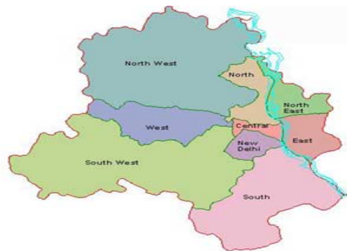
Figure 1. Map of Delhi (India)

The plant material of both species with the substratum was collected from various localities of Delhi (Fig. 1) during the month of September. The precise location of mosses with type of growth forms, the proximity to pollution sources and the nature of pollution sources were recorded on the spot. A population of the same species growing in the forested clean environment is taken as control. Samples were manually freed from solid litter, dust and other unwanted material. A jet of air was used to remove soil trapped on mosses. The specimens were dried in hot air oven for 24 hrs at 40°C. Five grams of material was taken and crushed with mortar and pestle. The soil and substratum to which moss species were adhered was stored in paper bags. The soil samples were oven dried, crushed and subjected to acid digestion. Estimation of the heavy metals in the plant samples as well as in the substratum was done by atomic absorption spectroscopy according to Allen (1989), using AAS ZEE nit 60/65.