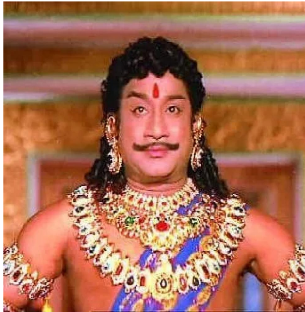
SIVAJI GANESAN (Visible Lord Shiva)

jpiuAyfpy; fNzrd; vd;why; gyUf;Fj; njhpahJ. Mdhy; rpth[p fNzrd; vd;why; midtUk; mwptH. jdJ ebg;Gj;jpwikahy; “ebfH jpyfk;” vd;W kf;fs; kdjpy; gjpe;jtH. guhrf;jp> ghrkyH> ghYk;goKk;> jq;fg;gjf;fk; Nghd;wit ehd; urpj;j mtuJ glq;fs;.